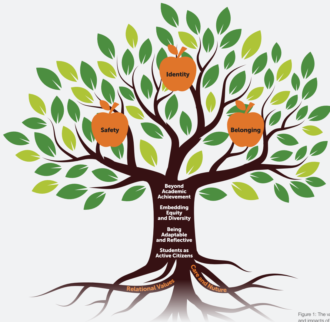
Figure 1: The values, principles and impacts of inclusion

These four guiding principles represent the mechanisms by which schools can ensure students' sense of inclusion. They have been developed in consultation with students, educators, school leaders and parents across all 32 London boroughs.